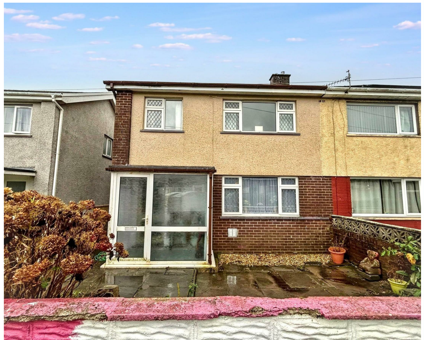
31 Maes Piode, Llandybie, Ammanford, Carmarthenshire, SA18 3YS

This floorplan is only for illustrative purposes and is not to scale. Measurements of rooms, doors, windows, and any items are approximate and no responsibility is taken for any error, omission or mis-statement. Icons of items such as bathroom suites are representations only and may not look like the real items. Made with Made Snappy 360.